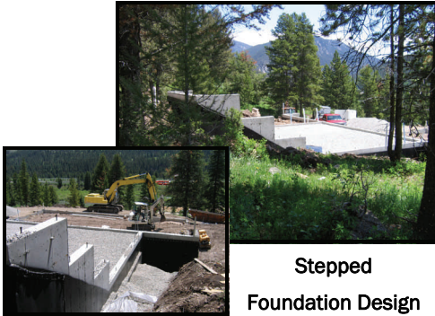
Stepped Foundation Design

Redleaf licensed Professional Engineering (PE) has experience performing concrete and Concrete Masonry Unit (CMU) designs for a variety of applications. These applications include foundations, retaining walls, fire places, underground mechanical vaults, and storm water/irrigation structure designs, etc.