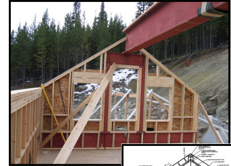
Combination Steel and Wood Framing