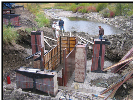
Concrete Point of Diversion Structure West Boulder River, MT

Redleaf licensed Professional Engineering (PE) has experience performing concrete and Concrete Masonry Unit (CMU) designs for a variety of applications. These applications include foundations, retaining walls, fire places, underground mechanical vaults, and storm water/irrigation structure designs, etc.